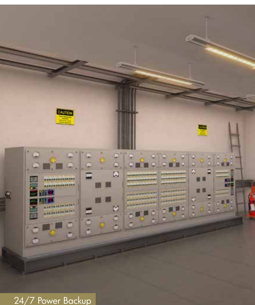
24/7 Power Backup