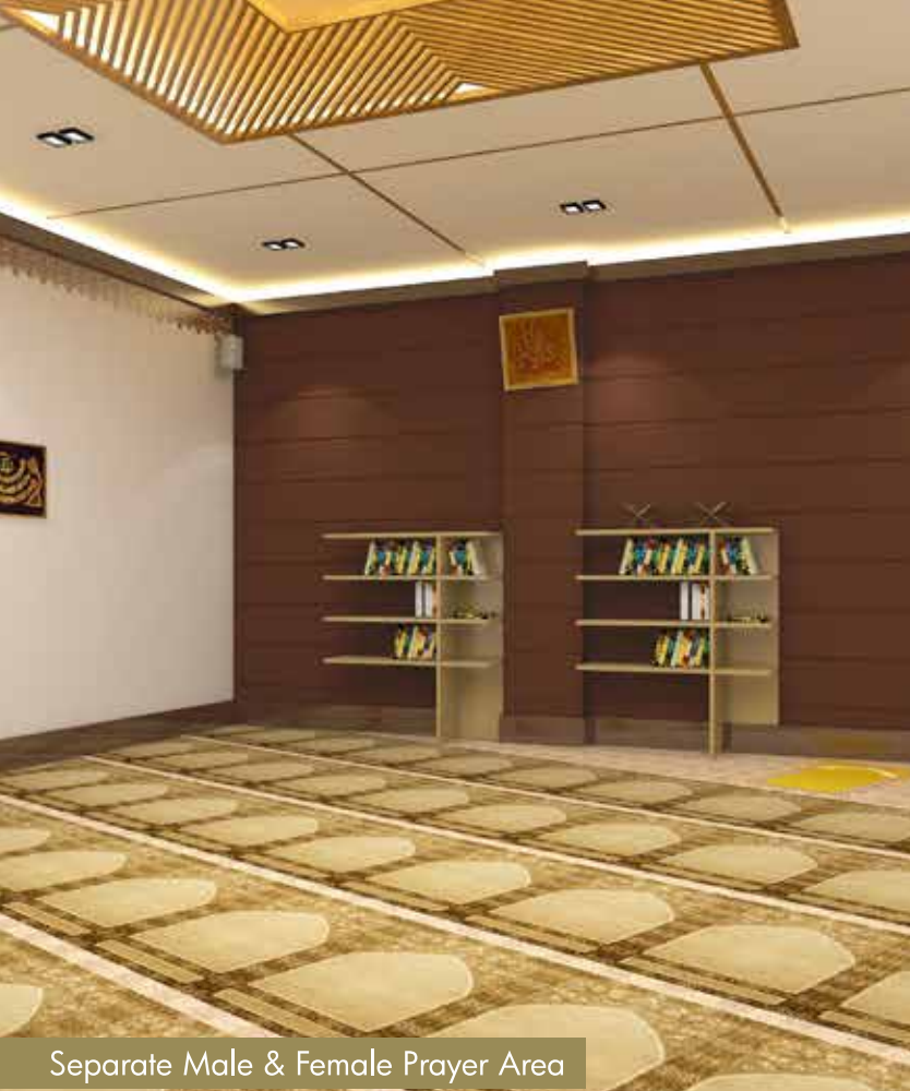
Separate Male & Female Prayer Area