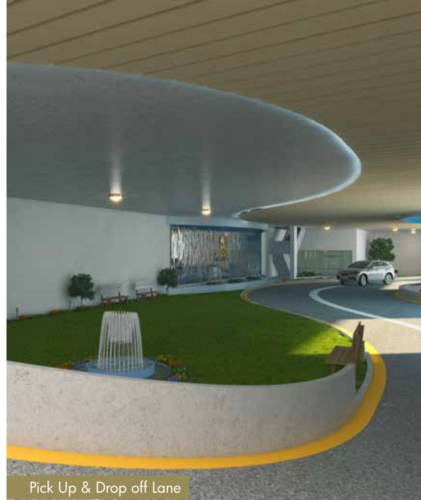
Pick Up & Drop off Lane