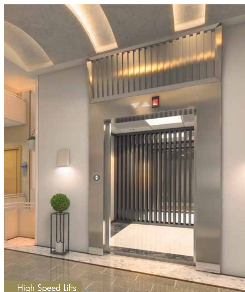
High Speed Lifts