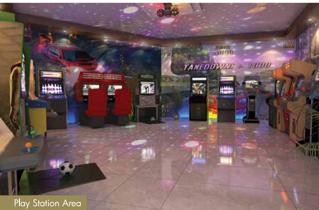
Play Station Area